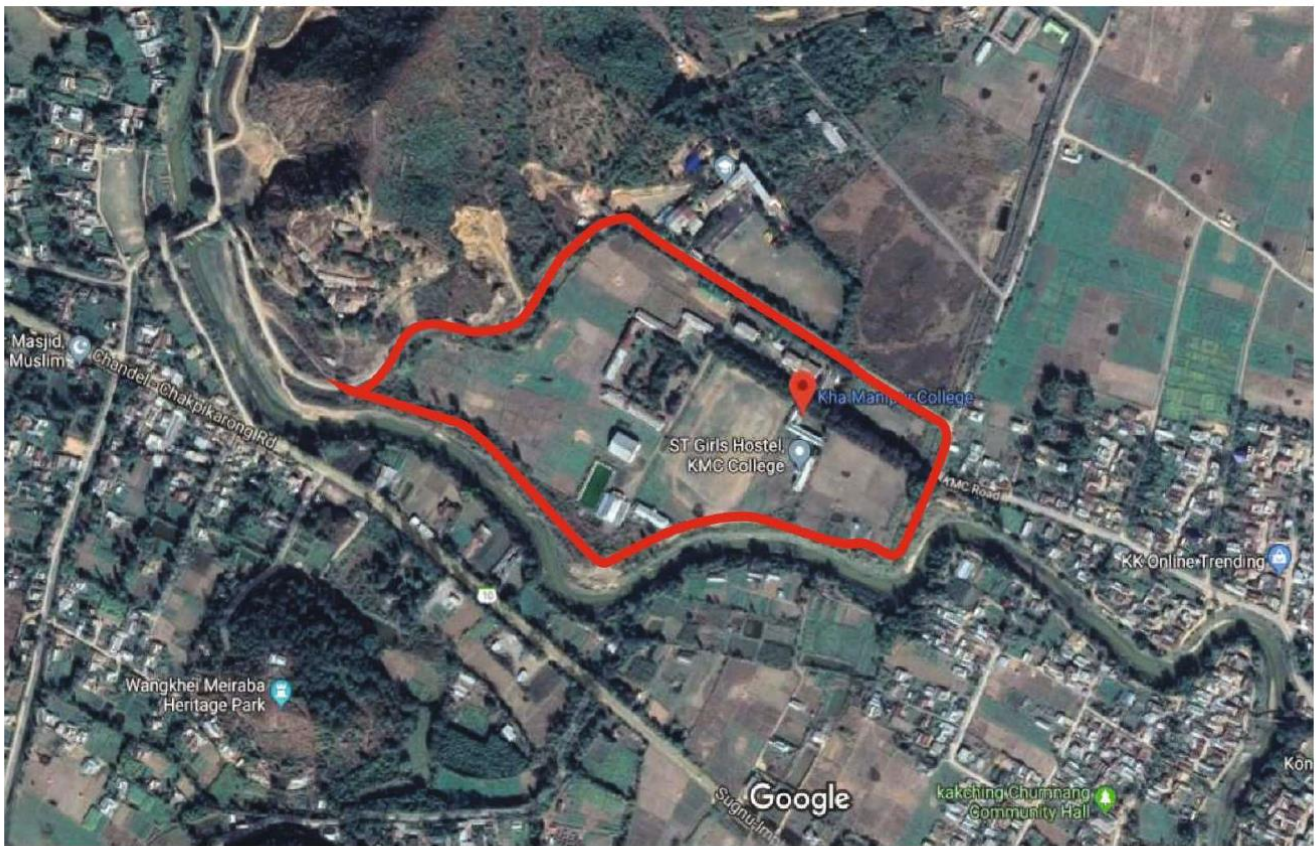
SATELLITE PICTURE OF KHA MANIPUR COLLEGE CAMPUS AND ITS SURROUNDINGS