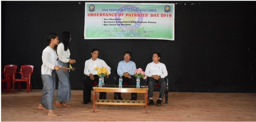
Observance of Patriots' Day 2019