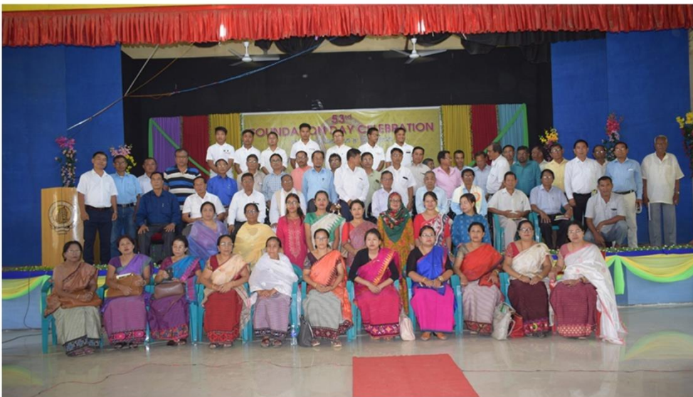
A Group Photo of the KMC Staff with the Founder Members and Founder Teachers on 27 th July 2019