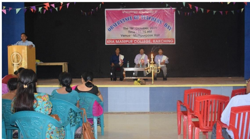
Observance of Teachers' Day 2019