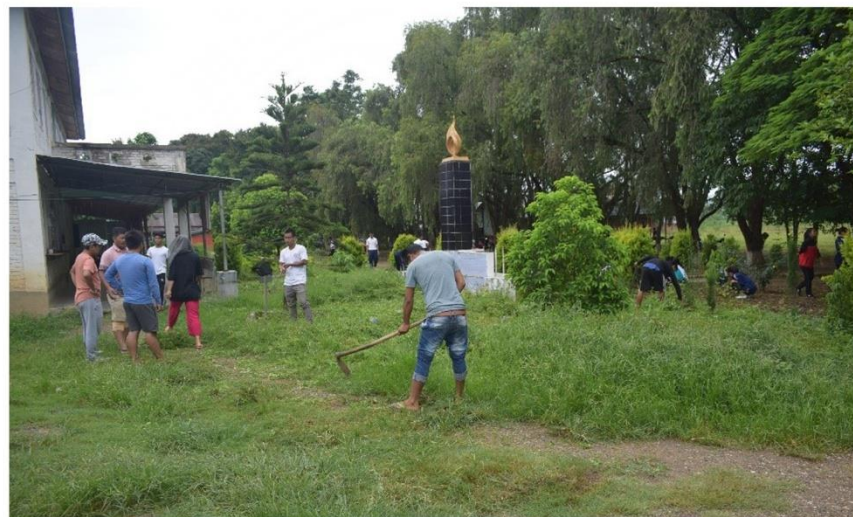
A Social Service on Gandhi Gayanti