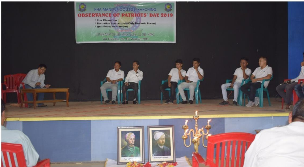
Quiz Competition on Patriots' Day 2019