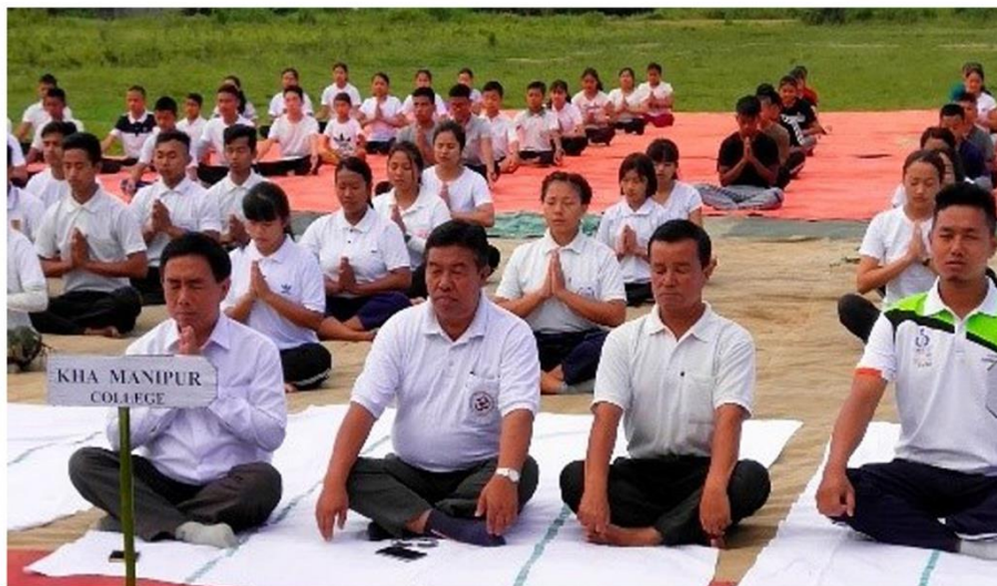
Observance of International Yoga Day on 21 st June 2019