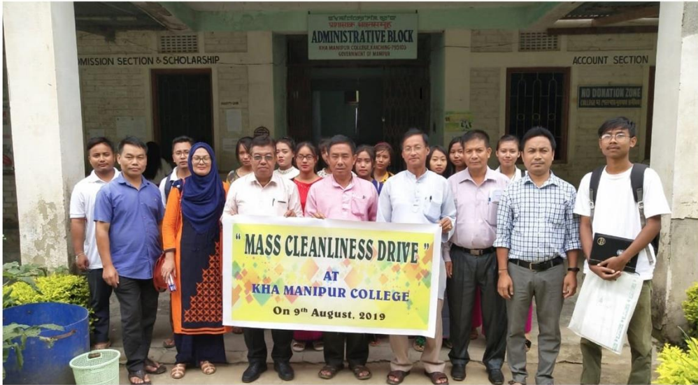
A Mass Cleanliness Drive conducted at KMC, Kaching campus on 9 th August 2019