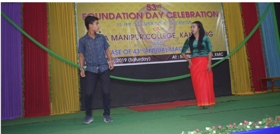
A One Act Play performed by Students of Kha Manipur College, Kakching