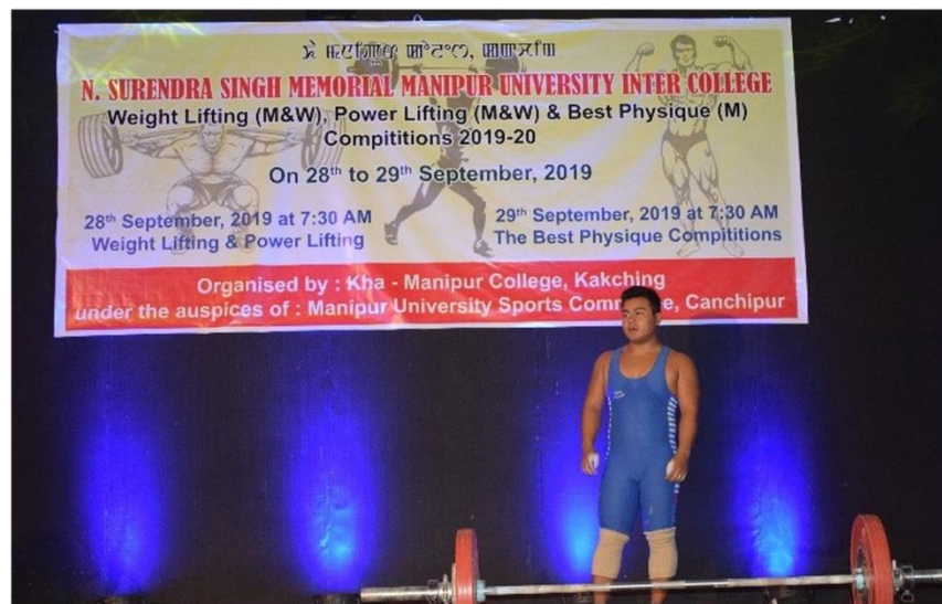
A candidate for Weight Lifting Competition