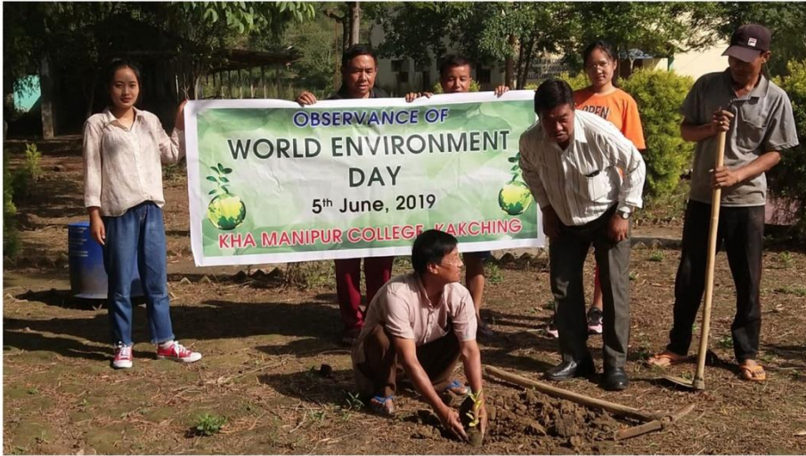
Plantation of Tree on World Environment Day within KMC, Kakching campus