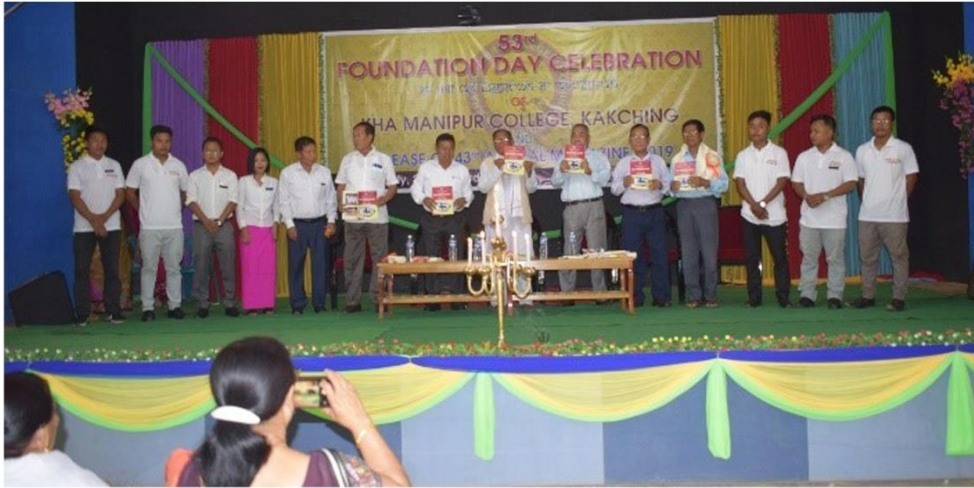
The 53 rd Foundation Day Celebration of Kha Manipur College, Kakching on 27 th July 2019