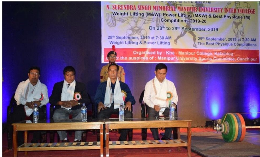
Inaugural function of Weight Lifting, Power Lifting and Best Physique Competition 2019