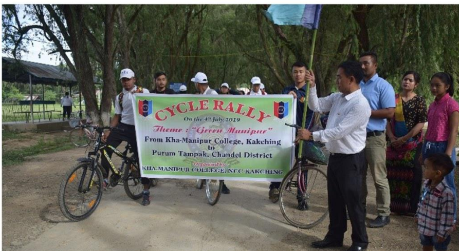
Cycle Rally orgd. by NCC, KMC, kakching