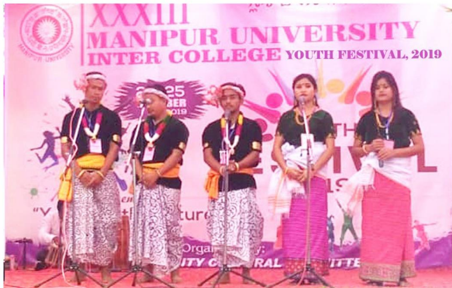
Cultural Programme Inter College Youth Festival at MU, canchipur 2019