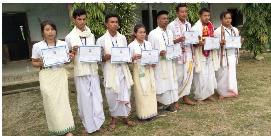
Elected Students of Students' Union 2019-20 Kha Manipur College, Kakching