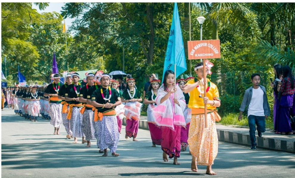
XXXIII Manipur University Inter College Youth Festival at MU, Canchipur 2019