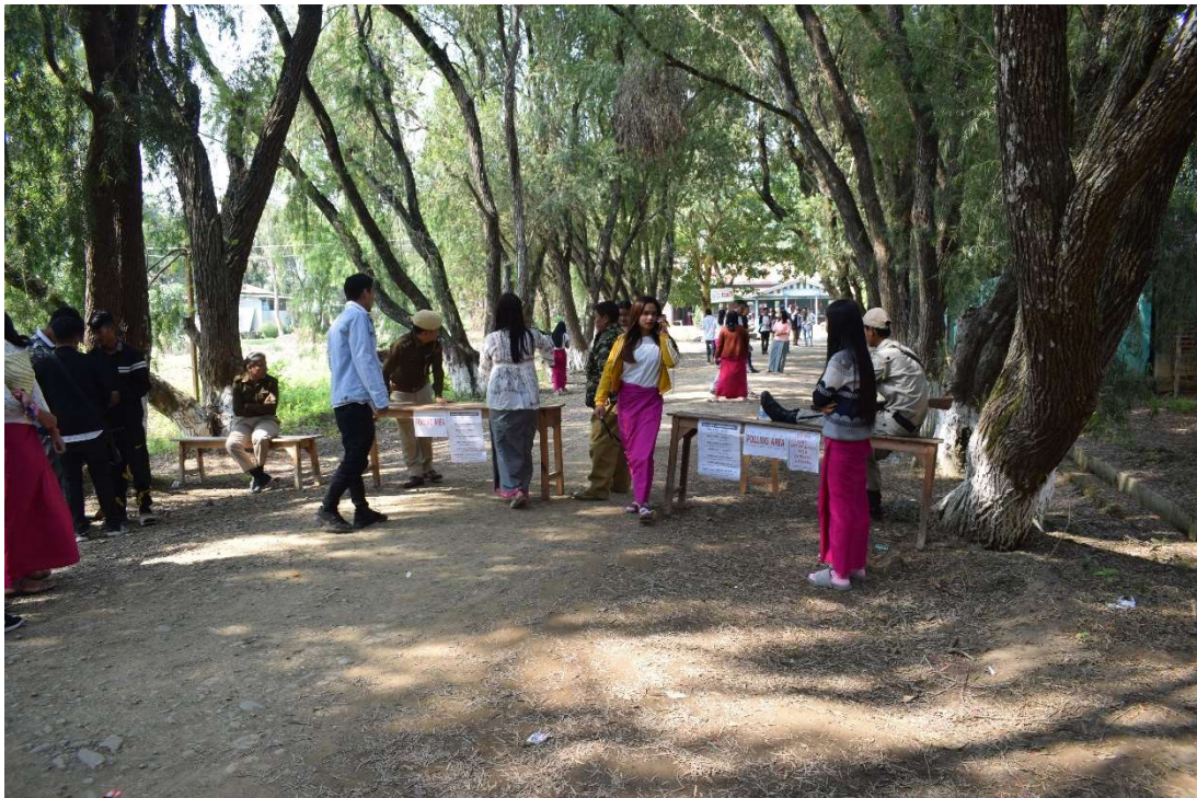
Kha Manipur College, Students' Union Election 2018-19