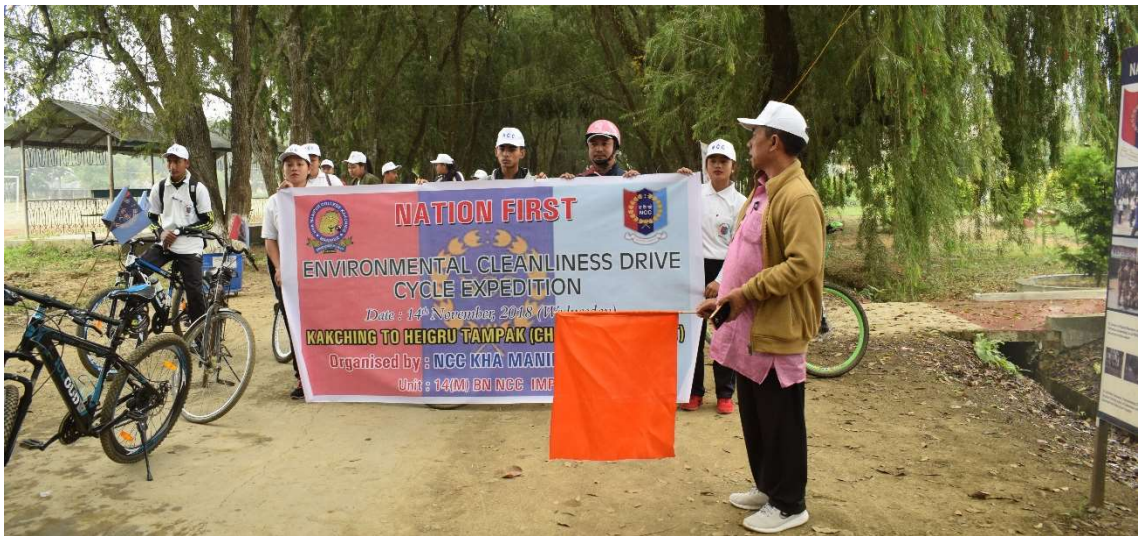
Cycle Expedition – Environmental Cleanliness Drive