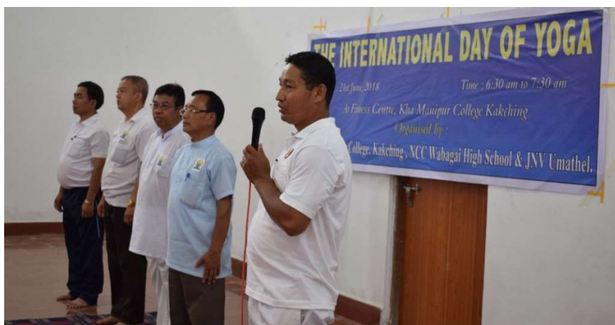
Observance of 4 th International Yoga Day, June 21, 2018