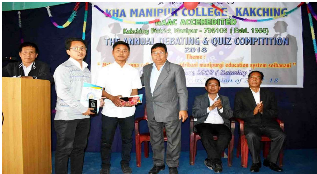
College week 2018, Prize Distribution