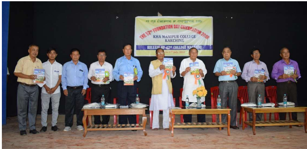
Publication of the 42 nd Edition of Kha Manipur College, Magazine 2018 on the 52 nd Foundation Day of the college on July 27, 2018