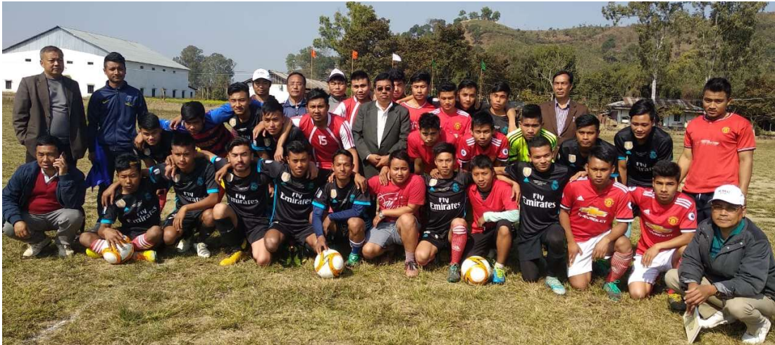
College week, Football players of KMC Kakching with Principal