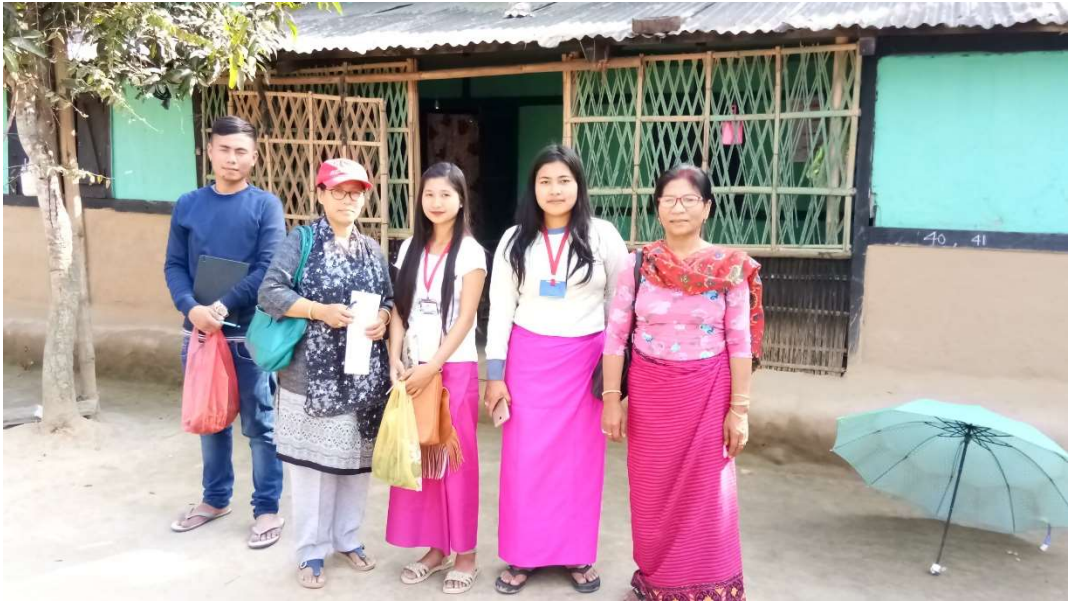
Anthropology Field Study Tour at Pub Nandapur Hojai District, Assam, 11 th to 16 th February, 2018