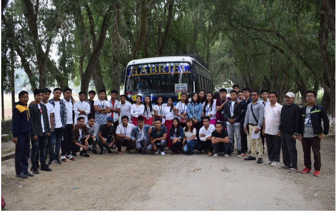
Internal excursion to Moreh, 2018