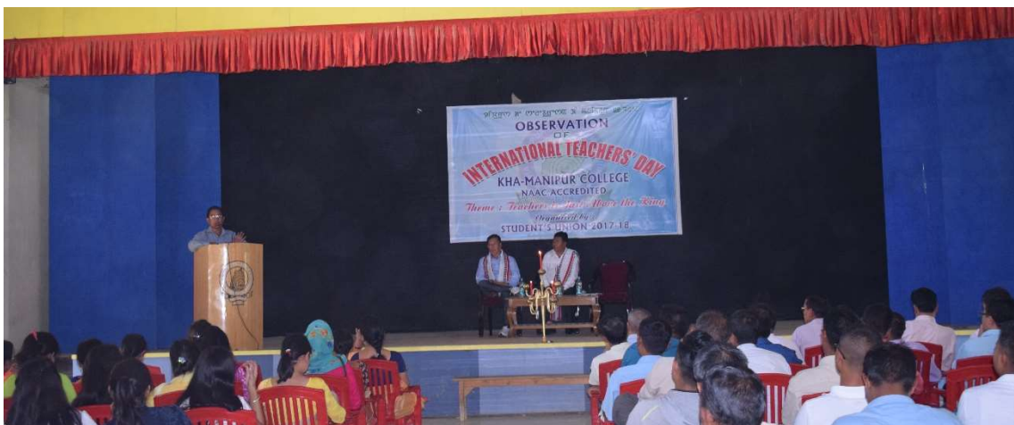
Observance of International Teachers' Day on October 5, 2018