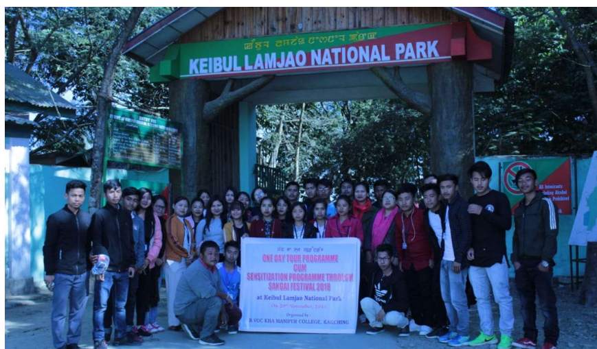
One Day Tour-Cum-Tourism Sensitization Programme, Organised by B.Voc. Dept. of Kha Manipur College, Kakching