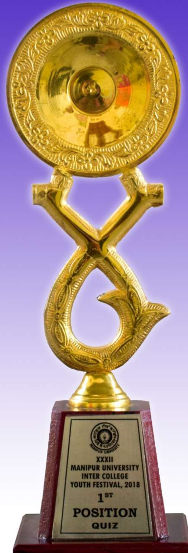
Trophy of Quiz Competition Winner