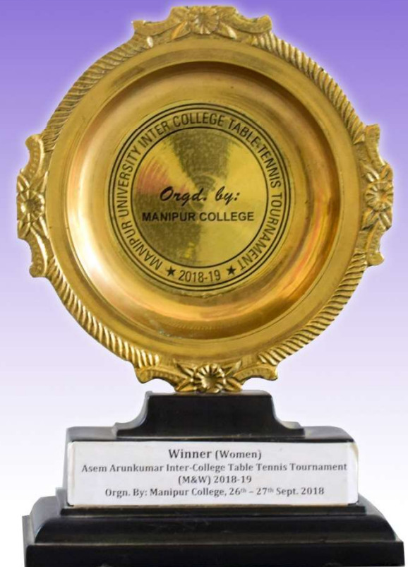
Trophy of T.T. Girls Winner