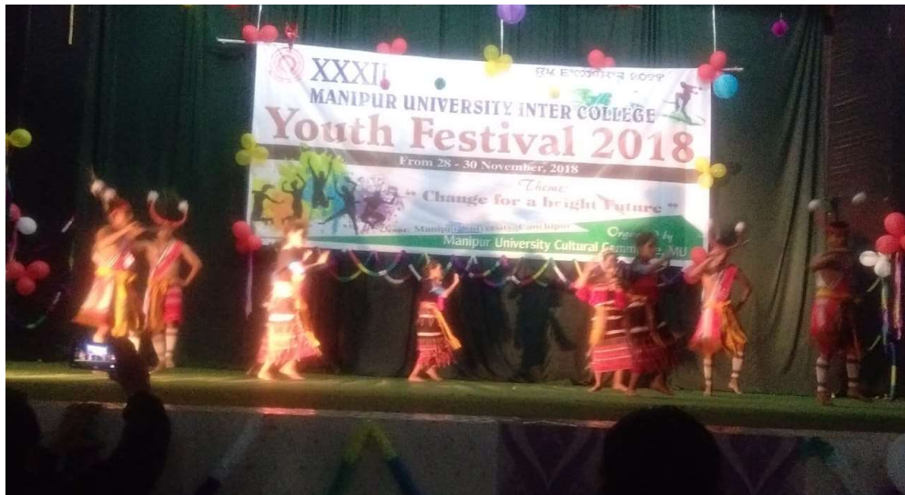
XXXII M.U. Inter College Youth Festival, 2018