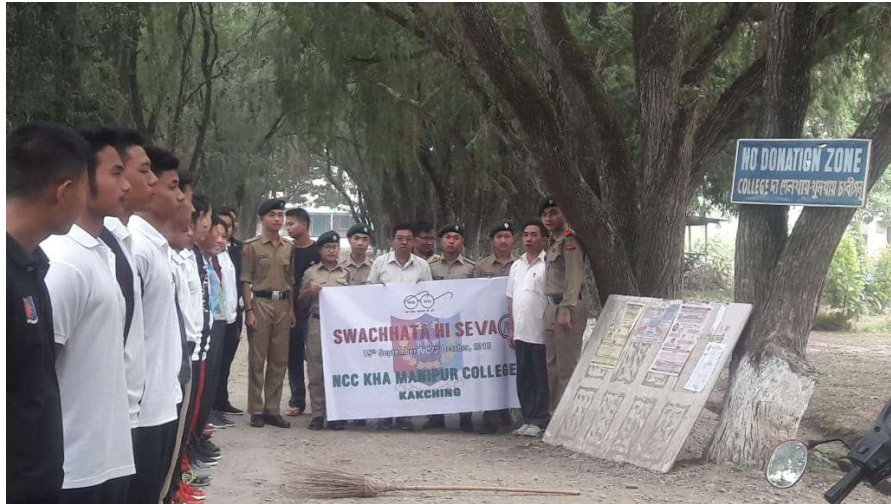
“Swachhta Hi Seva” campaign, 2018