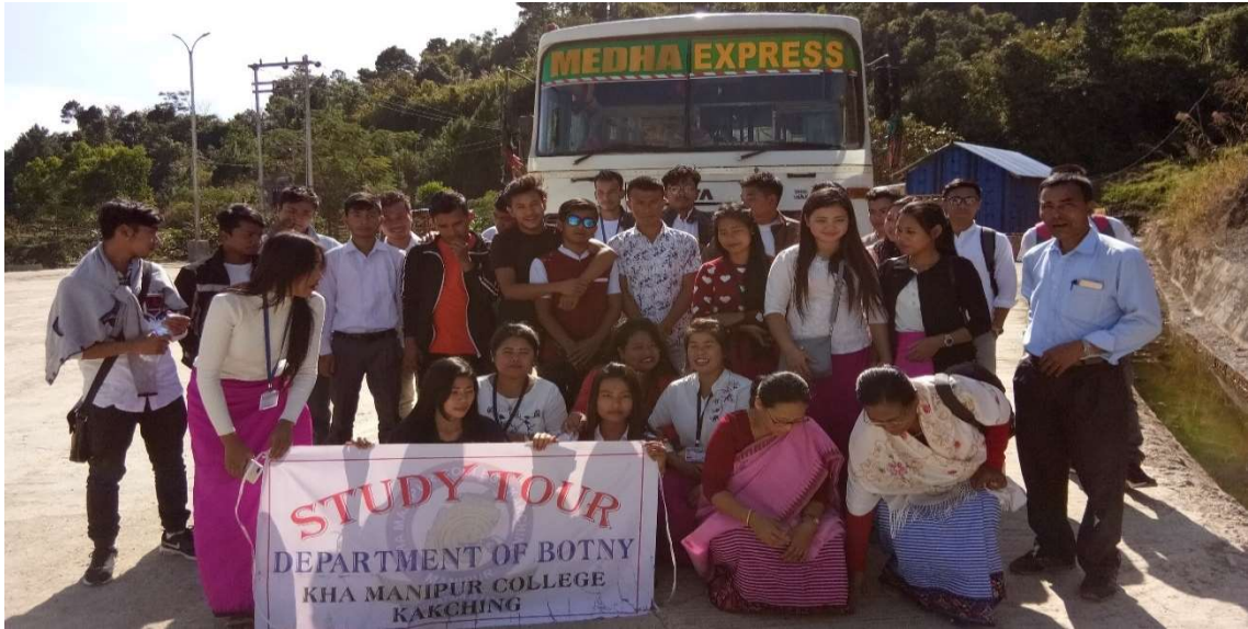
Study Tour of Botany Department at Mapithel Dam