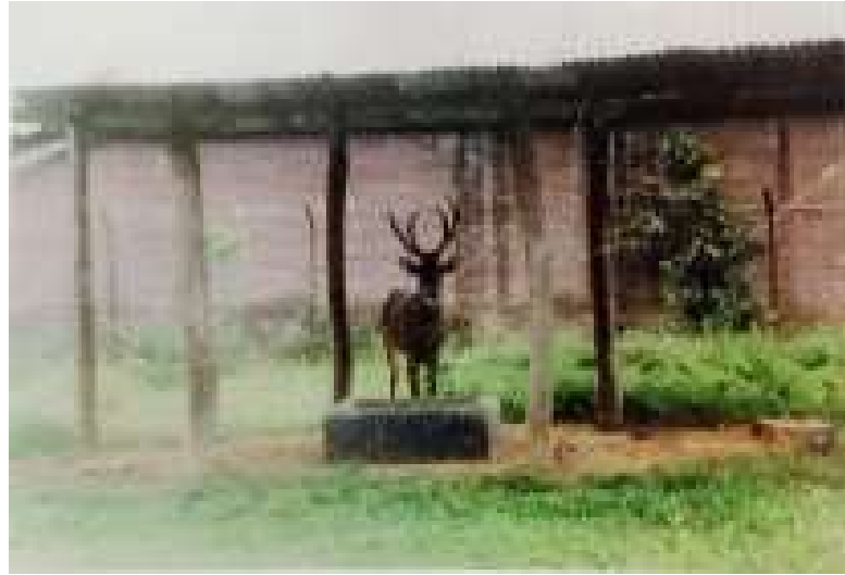
Manipur Zoological Garden, Sangai (Brow Antlered Deer)