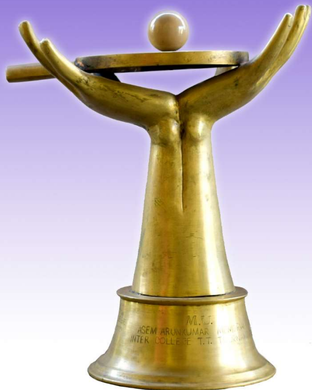
Trophy of T.T. Boys Winner