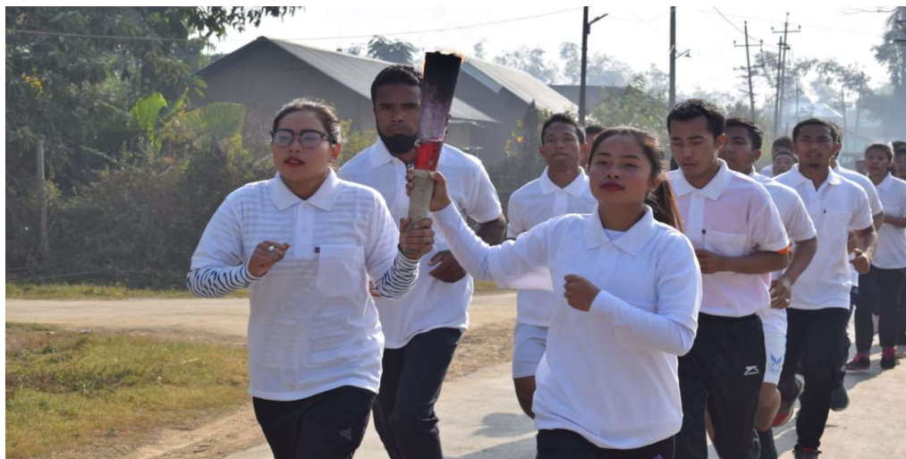
Torch Run, Annual Sports Meet (College Week) 2018