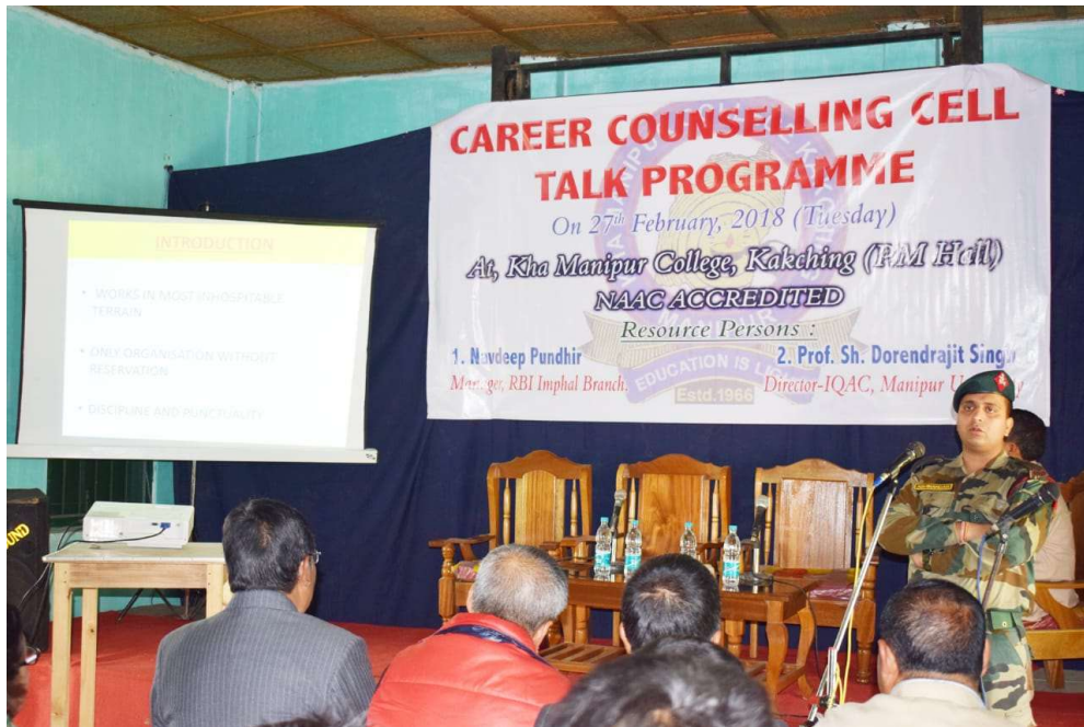
Commander, the 27 th Assam Rifles Keirak (Kakching)