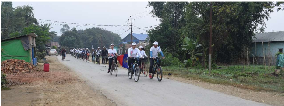
Cycle Expedition on November 14, 2018 organised by NCC Wing of Kha Manipur College