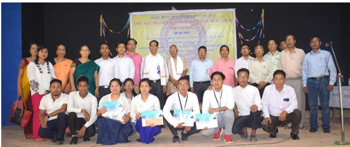
The Inter-College Debating Competition on October 8, 2018 hosted by Kha Manipur College, Kakching