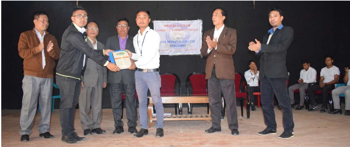
Community Harmony Campaign Week on November 19 to 25, 2018